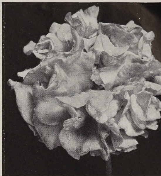
ASPACIA (BOLEN No. 9)

Maiden's Blush. Flesh-pink with small veins of deeper pink. Medium-sized, very double flower with recurved petals. Dark green foliage.