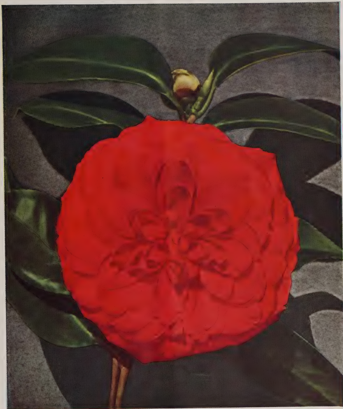
PRINCE EUGENE NAPOLEON (Pope Pius IX)