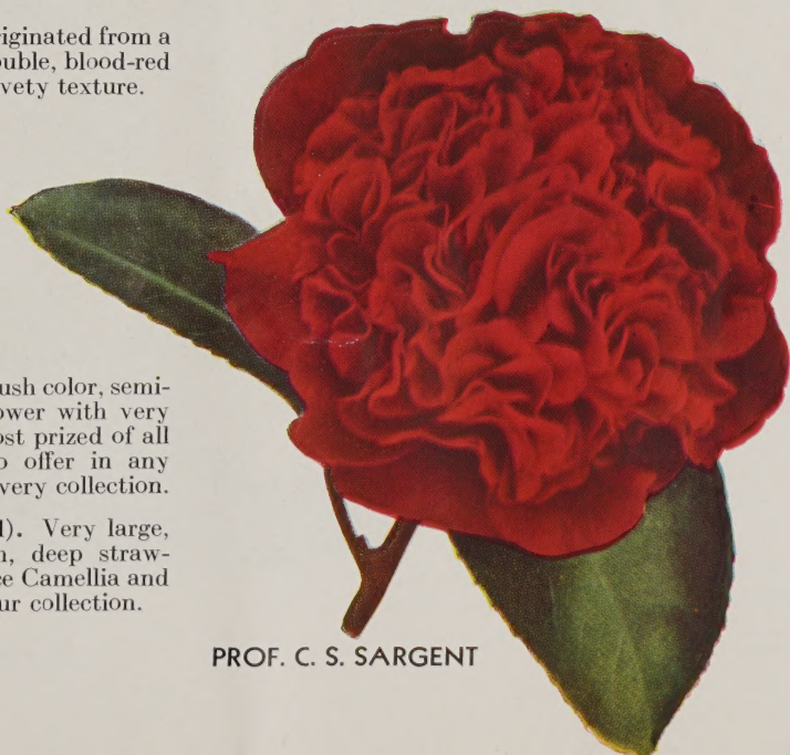
PROF. C. S. SARGENT