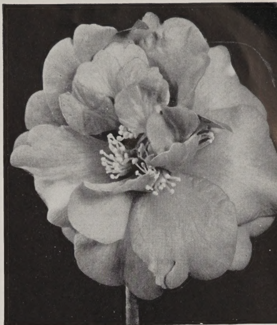
ELEANOR OF FAIROAKS